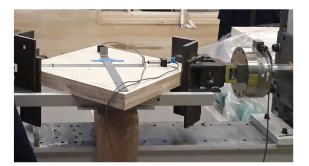
Figure 2: Practical diagonal compression test of a CLT panel

The panels were built by three layer of wooden lamellas and the aluminium plate was added between the first and second and/or second and third layer of boards. Two different thicknesses of the aluminium plate were used, 1 mm and 1.5 mm. Also, panels without aluminium plates were used as reference. Diagonal compression test was performed on the CLT panels, see Figure 2, where the modulus of shear could be calculated. The diagonal compression method was performed based on experience from Andreolli [5].