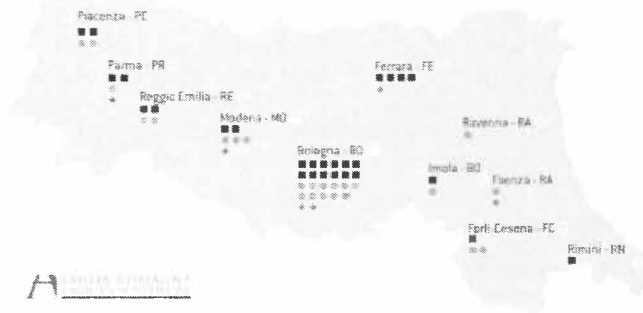
Figure 1. Schematic territorial distribution of Emilia-Romagna High-Tech network.

Referring in particular to Environment Energy and Sustainable Development, the network counts 5 Laboratories and 1 Centre: