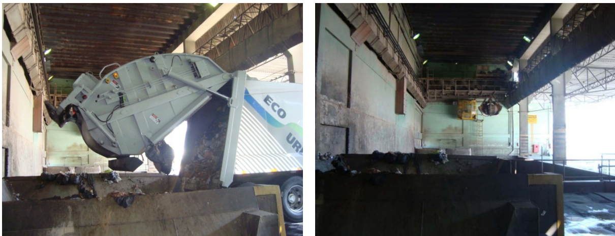
Figure 2 – Transfer station Vergueiro. [9]

In respect the recyclable materials collection, about 40% of housing units are served by home collection, generating 193 tons per day, which represents 1.05% of the total collected in the city in 2012. The rest of the residences that are not served by this collection, has alternatively deliver recyclable waste at the point of voluntary delivery, there are 1500 recyclable points and 76 ecopoints [5]. The amount of recyclable materials diverted from landfills could be higher if there were more points of voluntary delivery in, which citizens could walk, or if the collection trucks by city hall were extended to the complete city, also, is needed that environmental awareness campaigns reaches the entire population, starting in schools, institutions, neighborhood associations and by Media.