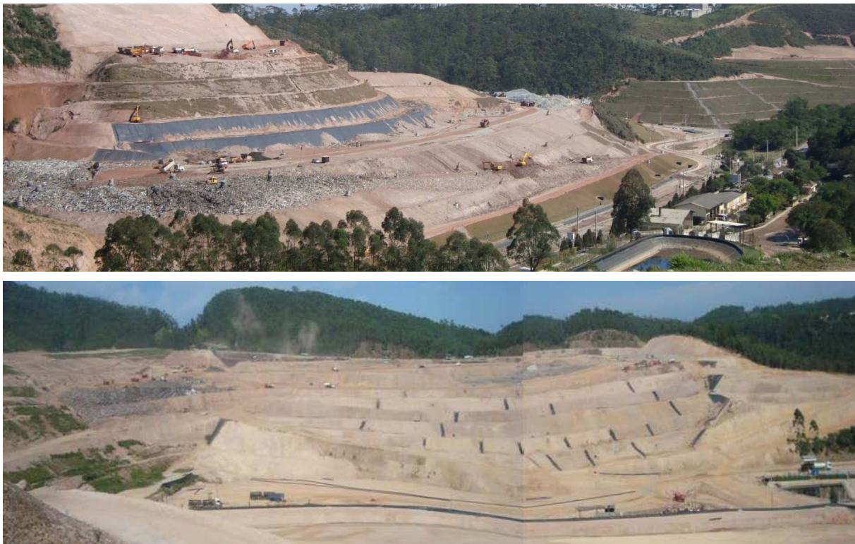
Figure 3 –CTL and Caieiras landfills. [9, 10]

In São Paulo there are no operation dumps and all the waste is destined for two landfills, CTL and Caieiras . The public landfill, CTL, with a receipt area of approximately 390,000 m 2 in a total of 1,123,590 m 2 , is operated by concessionaire itself hired by the city and began operations in 2010. It is scheduled for closure in 2025. The Caieiras landfill, operated by a private company called Essencis , being the largest landfill in the country with an area of 3,500,000 m 2 , of which 43% is covered with vegetation, began operations in 2002 and also has a lifetime of about 15 years. [7]