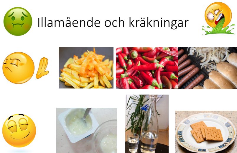
Figure 3 Screenshot showing advice on nutrition in case of nausea (giving information).

Figure 2 shows a page from the 'obtaining information' section with questions about the past medical history. The question is 'What are you allergic to?' A dropdown list with a green background becomes available with a selection of possible allergies: Gluten, Lactose, Peanuts, Nuts and Egg. It is possible for the woman to click on the dropdown list to show which allergies she has.