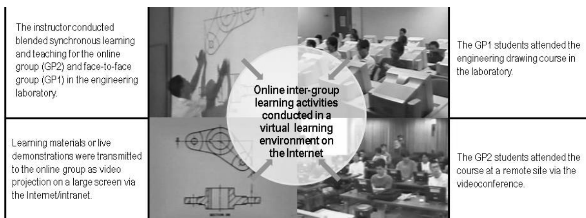
Figure 2. Synchronous blended teaching and learning (Szeto, 2014)